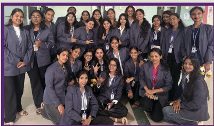
Women Development Cell