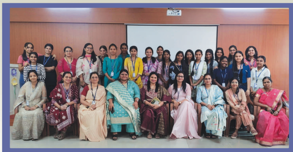
Women Development Cell